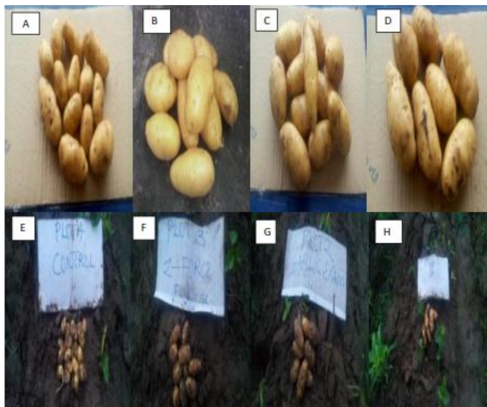
Plate 2: Biomass and total tuber yield for the different treatments. A and E= Tubers from control plot in storage and field respectively, B and F= Tubers from Z-force-treated plant in storage and field respectively, C and G=Tubers from Garlic extract-treated plant in storage and field respectively, D and H=Tubers from Ridomil-treated plant.

However, the application of garlic extract, ridomil and z-force fungicides significantly reduced late blight incidence by 32.92%, 35.83% and 29.17% respectively, which corresponded to better biological and tuber yields compared to control. Better biological yield and larger tuber sizes on plots treated with garlic and chemical fungicides could have resulted from the reduced disease incidence which may have increased the photosynthetic leaf area and greater amount of photosynthate being transferred to tubers for storage (Olanya et al., 2001). Lowered disease incidence by garlic extract may be attributed to inhibitory effects of bioactive compounds such as allicin (Rahman & Motoyama, 2000). This is in