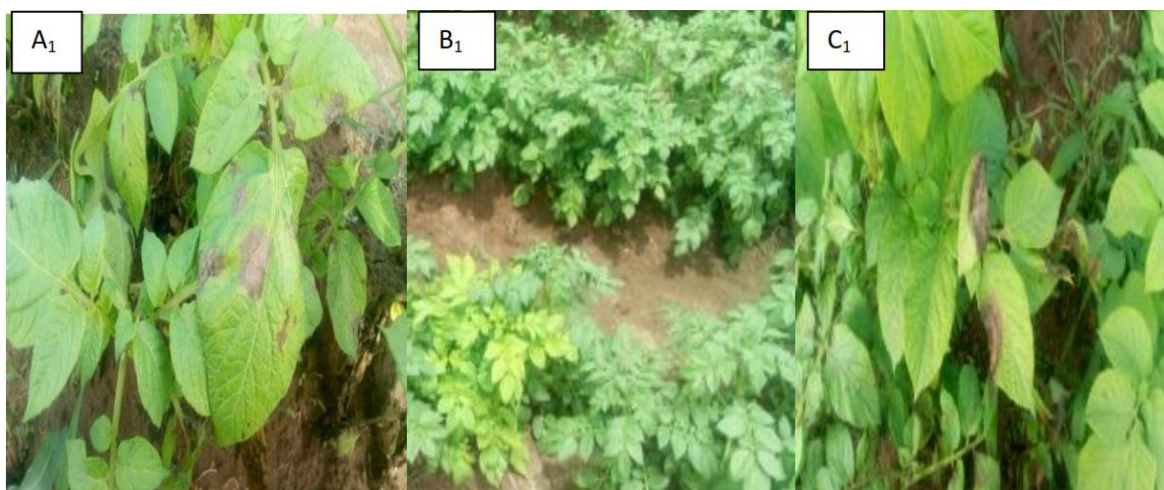
Plate 1: Photos of disease incidence. A 1 = First disease incidence at 5weeks after planting on Garlic treated plants, B 1 = First disease incidence at 5weeks after planting on Ridomil treated plants, C 1 = First disease incidence at 5weeks after planting on Z-force treated plants, A 2 = Elaborated disease incidence at 12weeks after planting on Garlic treated plants, B 2 = Elaborated disease incidence at 12weeks after planting on Ridomil treated plants, C 2 = Elaborated disease incidence at 12weeks after planting on Z-force treated plants.

incidence of 60%. The lowest biomass and tuber yield were recorded for control with 23.92g and 11.95t/h respectively and had the highest average disease incidence of 73.33%. Plate 2 shows biomass and total tuber yield for the different treatments as seen in figure 1. Figure 2 shows the disease severity curve.